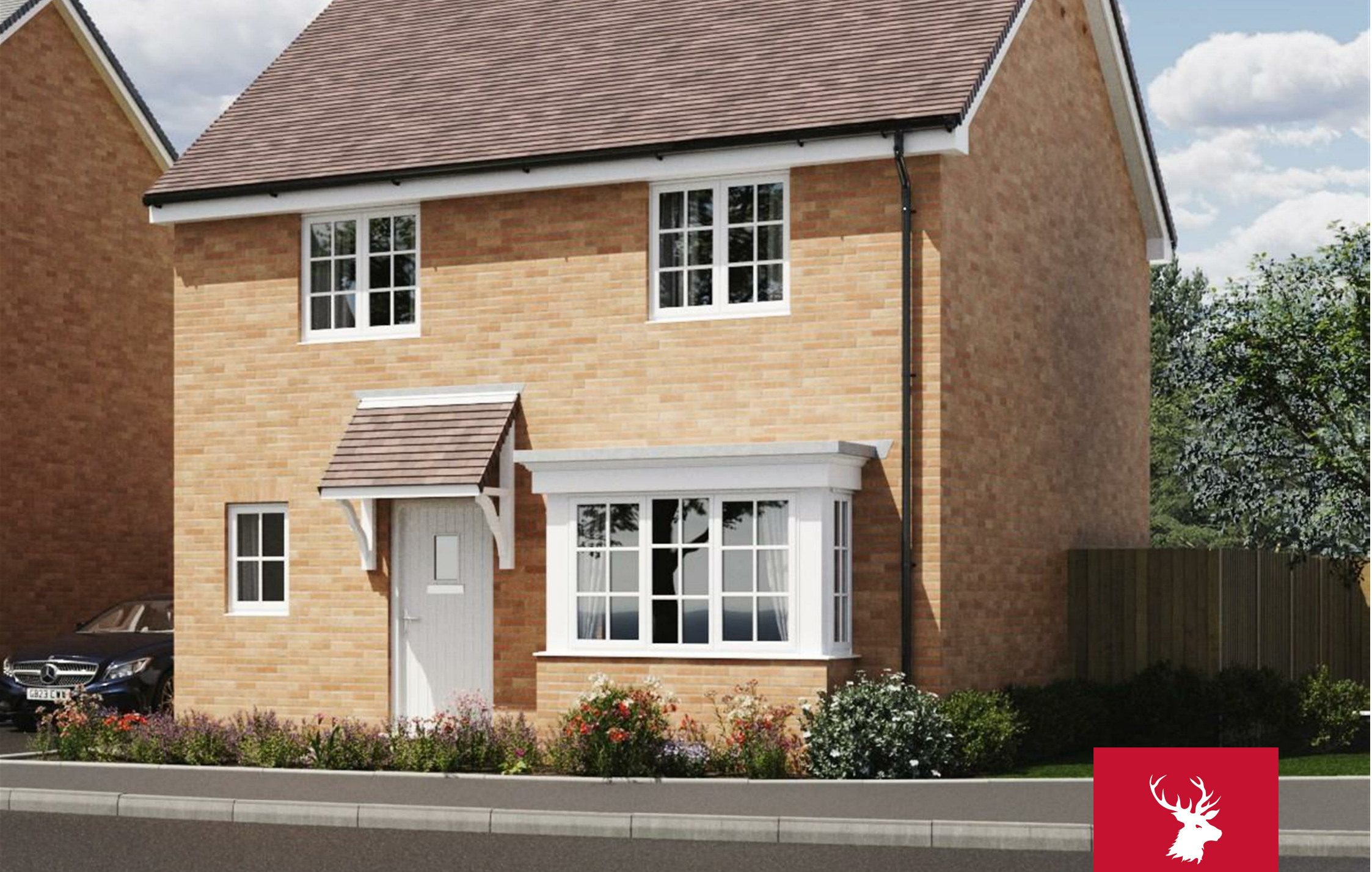
Plot 47 - The Milford